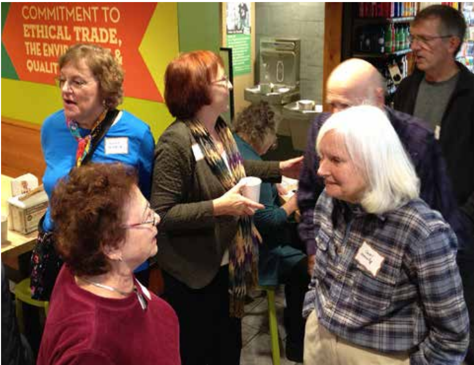
Volunteer Gathering at Whole Foods Market.

In our last report, we told you about our growing